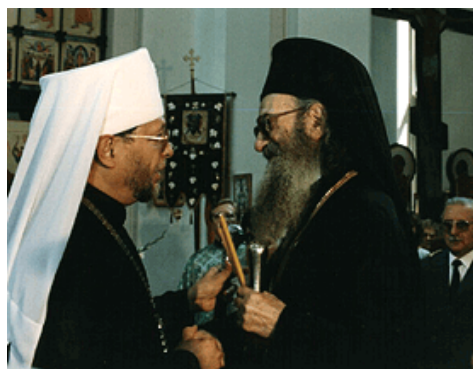
Metropolitan Theodosius welcomes Ecumenical Patriarch Dimitrios at St. Nicholas Cathedral, Washington, DC, 1990.

The history and staying-power, as well as the promise and possibilities, of the Orthodox Church in North America are well-represented by the Alaskan native parishes and by the former evangelical Protestants who are now Orthodox parishioners in Eagle River, Alaska. It is true that the stereotyping of the Orthodox Church as ingrown ethnic communities and of the Orthodox faith as a matter of “ancient and colorful rites” is powerful and persistent. It is also true that the Orthodox communities often enough project precisely what encourages such stereotyping. Still, all simplistic reductionisms are misleading and inaccurate. The reality of Orthodox life in North America is complex, and sometimes contradictory. Stereotyping of any kind only distorts this complex and contradictory reality.