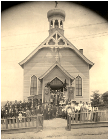
St. Nicholas Church, Olyphant, P.A.

With the sale of Alaska to the United States in 1867, however, the future of the Alaskan Mission seemed far less secure. In the eyes of the new American authorities, the Orthodox mission was an unwelcome relic of Alaska's past. In open cooperation with proselytizing Protestant missionary groups, the new territorial government launched a campaign to "Americanize" the Orthodox native peoples. Orthodox prayers, icons, and native languages were forbidden in the new American schools and denounced from the new Protestant pulpits. Repeated protests by the Orthodox bishop to the President, Congress, and military occupation authorities were ignored.