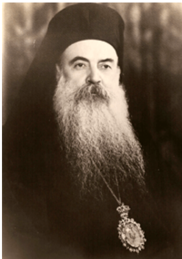
Ecumenical Patriarch Athenagoras (Spirou).

Among the most successful of Orthodox ethnarchs was the Greek Archbishop Athenagoras (1886-1972). As late as 1930, the rabid feud between “royalists” and “Venizelists” continued to impoverish the Greek immigrant community in America. Recognizing the need for compromise after the death of Venezilos, the Church of Greece and the Ecumenical Patriarchate agreed to send the young, progressive Bishop of Corfu, Athenagoras (Spirou), to the United States to reconcile the two factions. Athenagoras took up this difficult task in February 1931. Centralizing the administration of the archdiocese in his own person, Athenagoras unilaterally suppressed the separate dioceses, creating one large archdiocese under his direct control. The other Greek-American bishops were induced to become his powerless auxiliaries, or forcibly retired. Athenagoras then proceeded to skillfully coerce two, sometimes even three, splintered Greek communities into a single parish again. Parishes were reestablished where political controversy had caused earlier communities to fail.