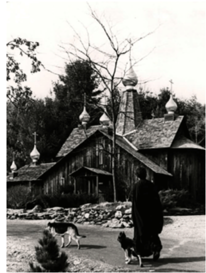
New Skete Monastery, Cambridge, NY.

In truth, Orthodox monasticism in North America has always encountered difficulties. Immigrant generations were reluctant to encourage their children to renounce the material culture of America. Likewise, ethnic Orthodox clergy encouraged monastic-minded Americans to seek their vocations not in America, but in the various homelands or on Mount Athos in Greece. Thus the Greek Archdiocese, for example, established its first (and short-lived) monastery in America only in 1961, and its second only in 1988.