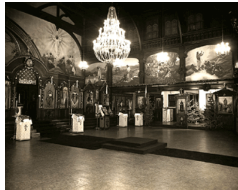
Holy Virgin Protection Cathedral, NYC, which served as the cathedral of the Primate of the Metropolia/OCA, 1943-80. The cathedral building also housed the Church's chancery offices, 1943-74. The church is currently the Cathedral of the Diocese of New York and New Jersey.

Following the publication of a 1929 Papal Decree that further limited the freedom and independence of the Greek Catholic Church, a large number (25,000) of Uniates based in Johnstown, Pennsylvania, left the Greek Catholic Church for Orthodoxy, much as their kinsmen had done 40 years earlier. Although the "Metropolia" would have seemed to be their logical home in Orthodoxy, these Carpatho-Russians, fearing "russification," asked for, and received, their own "Carpatho-Russian Orthodox Greek Catholic" jurisdiction from the Ecumenical Patriarchate in 1938.