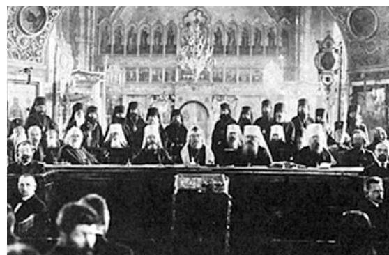
Newly elected Patriarch Tikhon presides at “All-Russian” Church Council in Moscow, 1917.

Throughout the next seventy years (1917-1989), the atheistic Bolsheviks would wage a relentless war against the Church. The Russian Orthodox Church was legally dissolved, and a radical, Soviet-controlled movement called “The Living Church” was established in its place. All Church properties and assets, including icons, were confiscated by the new Soviet government. Four-fifths of the Bishops attending the “All-Russian Council” would be executed, die in prison, or be forced into permanent exile. More than 12,000 clergy would be murdered, more than 100,000 Orthodox Christian lay leaders