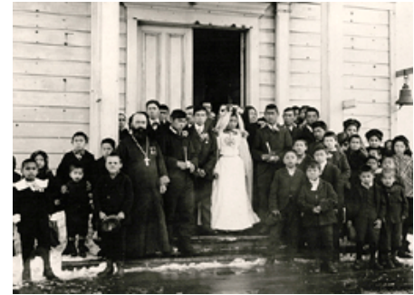
Orthodox wedding party on St. Paul Island, ca. 1898.

With the transfer to American rule in 1867, most ethnic Russians, including the vast majority of Orthodox priests, returned to Russia, leaving the 12,000 native Christians, 9 Orthodox parishes, 35 chapels, 17 schools, and 3 orphanages to fend largely for themselves. In 1872, the diocesan see was transferred from Sitka to San Francisco, and the bishop was able to supervise the mission only from afar. Over the next 100 years, the Alaskan mission received only sporadic assistance from the Orthodox community in the “lower 48.”