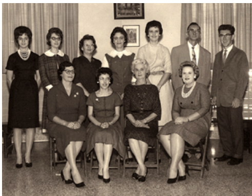
Sunday school teachers at Holy Trinity Orthodox Church, Charleroi, PA, 1961.

Following Hanson's immigrant thesis (“What the son wishes to forget, the grandson wishes to remember”), the ethnic churches were revitalized by the “third generation,” which first appeared in the Orthodox churches during the general American return to religion in the 1950's. By the early 60's, the situation in the Pennsylvania parish mentioned above had greatly improved: