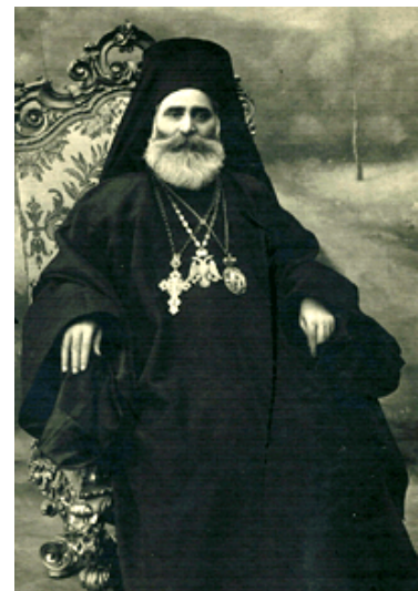
Ecumenical Patriarch Meletios (Metaxakis).

Metaxakis was one of the most fascinating characters in Orthodox church history. He was the only man successively to lead four autocephalous (independent) Orthodox Churches: those of Cyprus, Greece, Constantinople (Turkey), and Alexandria (Egypt). On the basis of a 1908 decree of the Ecumenical Patriarch that the independent “trustee” Greek parishes in America should receive episcopal oversight from the Church of Greece, Metaxakis journeyed to America in the summer of 1918 to survey the situation. Three months later he returned to Greece and appointed Bishop Alexander of Rodostolou as his resident American legate. Alexander was charged with the unenviable task of initiating canonical order among the independent Greek parishes throughout North America.