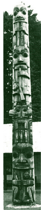
A totem pole in Sitka depicts historic battle between Russian settlers and a local tribe.

In 1728, and again in 1741, Vitus Bering and Alexis Chirikov mapped the Alaskan coast, and in the process set off a “Fur Rush”—creating a Russian “Wild East” much like the later “Gold Rushes” of the American “Wild West.” For the next forty years, Russian traders and trappers would make annual or biannual trading expeditions to the Aleutian Archipelago in search of valuable sea otter pelts. Poorly equipped, these Siberian entrepreneurs were not seasoned military men, but frontier adventurers, much like Daniel Boone. Unlike Boone, though, these adventurers were bachelors.