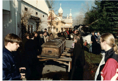
Fr. Alexis Toth was canonized in 1994.

“I gave them no permission to build, and I shall grant you no permission to work there.”