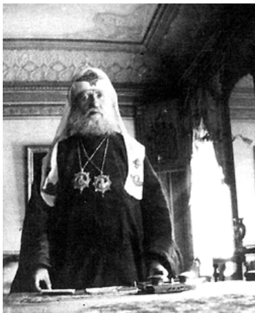
St. Tikhon, Patriarch of the Russian Orthodox Church, under house arrest.