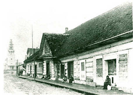
Up the street from a Sitka trading post, St. Michael's Cathedral nears completion.

Traveling from village to village by sea kayak, for which he would later suffer constant pain and some crippling in his legs, Veniaminov impressed his parishioners with his fluency in their language, respect for their traditions, and pastoral concern. In 1836, he joined a Russian schooner traveling south to minister to those stationed at the most distant Russian outpost in America, Fort Ross, near San Francisco. While in Spanish California, Veniaminov visited the Franciscan missions along the coast, conversing with the Spanish monks in Latin. In a rare gesture of ecumenical