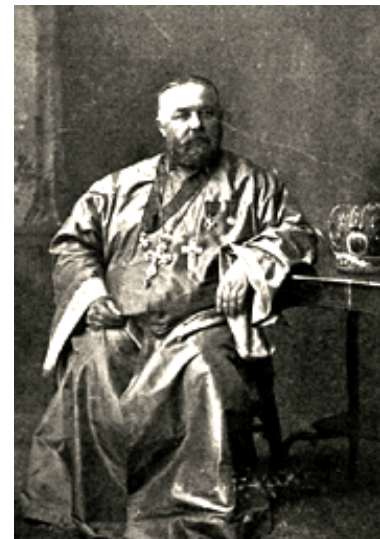
Fr. Alexis Toth was instrumental in returning some 20,000 Eastern-rite Catholics to the Orthodoxy of their ancestors.

At this he threw the paper on the table and loudly exclaimed: