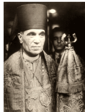
Metropolitan Theofan [Fan] (Noli) established the Albanian Orthodox Mission under the American diocese.

Although Orthodox Christianity has existed in Albania since the second century AD, and the Orthodox historically constitute 20 percent of the population of Albania, the first Orthodox liturgy in the Albanian language was celebrated not in Albania, but in Massachusetts. Subsequently, when the Orthodox Church was allowed no official existence in communist Albania, Albanian Orthodoxy survived in exile in Boston (1960-1989). It is a curious history that closely entwines Albanian Orthodoxy with the Bay State.