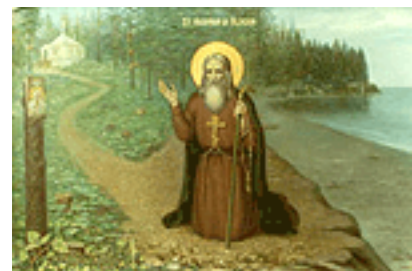
St. Herman moved to Spruce Island where he nursed the sick, raised orphans, and performed miracles.

Through St. Herman, the Alaskan Mission was blessed by the traditional monastic example which SS. Cyril and Methodius provided to the Slavs, centuries earlier. By SS. Innocent and Jacob, the Alaskan Mission demonstrated the linguistic adaptability, cultural sensitivity, and educational outreach characteristic of Orthodox missions from Moravia to Kamchatka. Unfortunately, the heroic missionary work of the Siberian traders who married, converted, and raised their families in the Orthodox faith, and that