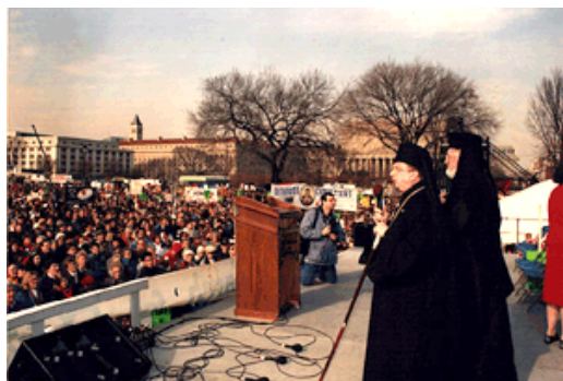
Orthodox Christians are a visible presence in anti-abortion demonstration in Washington, DC, 1992.

catastrophic earthquake. This trend culminated in 1991 with the creation by SCOBA of an inter-Orthodox relief agency, the International Orthodox Christian Charities (IOCC) to channel aid from all Orthodox jurisdictions in America throughout the world. IOCC has generated strong support from all the Orthodox and fostered new avenues for inter-Orthodox cooperation at all levels.