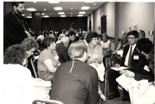
Layty and clergy engaged in discussions during the 8th All-American Council in Washington, DC, 1986.

For centuries, frequent and regular reception of the eucharist had not been common among Orthodox. Yet, as a result of a rediscovered eucharistic ecclesiology, a new generation of church leaders began to promote frequent communion, and the ecclesiology such reception inferred. This eucharistic renewal, sparked by the preaching and writings of Frs. Schmemmann and Meyendorff, marked a gradual, but profound, shift in popular Orthodox piety in the 1960’s, beginning in the Metropolia, but eventually