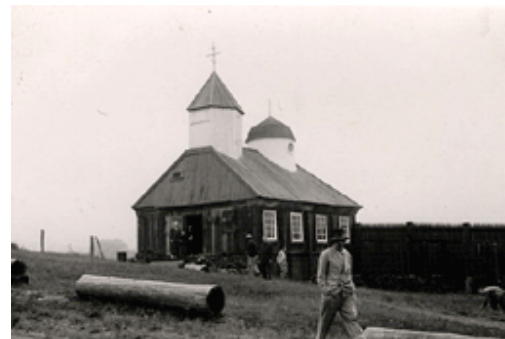
Chapel at Fort Ross, north of San Francisco, where the Russians maintained a foothold for 29 years.