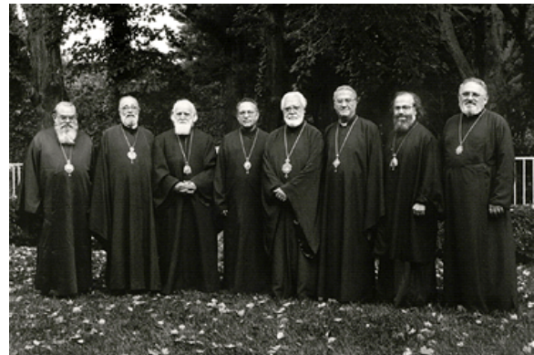
Standing Conference of Canonical Orthodox Bishops in the Americas (SCOBA), October 1991.

In the narrow environment of ethnicity, ethnarchy, and cultural hibernation after 1925, there was little communication between Orthodox jurisdictions, and even less consciousness of Orthodox community. Attempts to reconstruct forms of inter-Orthodox community from the wreckage of the immigrant Church began only in the 1940’s at the instigation of the federal government. The wartime need for Orthodox military chaplains led to the creation in 1942 of a “Federation of Primary Jurisdictions of the Orthodox Greek Catholic Churches in America” to serve as an endorsing denominational body for the Pentagon. Fr. Vladimir Borichevsky of the Metropolia was subsequently appointed as the first Orthodox U.S. military chaplain. Once the war ended, however, the organization quickly languished.