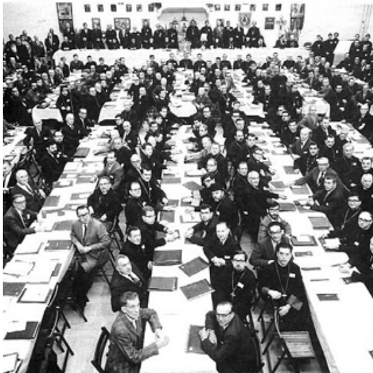
First All-American Council of the autocephalous Orthodox Church in America, St. Tikhon Monastery, October 1970, at which autocephaly was ratified by delegates representing the entire Church.

Despite enthusiasm and initial success, the new "Orthodox Church in America" was not welcomed by all Orthodox. Orthodox Churches behind the Iron Curtain, led by the Russian Church, recognized the new status and name of the old Metropolia, while others, led by the Greek Ecumenical Patriarchate, adamantly refused to accept even the idea of an autocephalous "Orthodox Church in America." These Greek-led churches based their opposition to the OCA on the long-standing Greek claim that the Ecumenical Patriarchate alone among Orthodox Churches, as the "first among equals," has the authority to grant autocephaly. Some, such as the Antiochian and Romanian Patriarchates, continue to withhold official comment. The issue remains in dispute. In recent years, however, discussions between the OCA and the Ecumenical Patriarchate have resumed, and the resolution to the chaotic ecclesial situation in America is high on the agenda of world Orthodoxy.