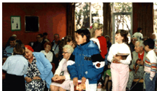
Residents of SS. Cosmas and Damian Adult Home, Staten Island, NY, enjoy a special visit from children of a local parish. Affiliated with the Orthodox Church in America, the home has provided for spiritual as well as physical needs of the elderly since 1977.

On a secular level, the symbols of Orthodoxy are increasingly visible as well. Recent changes in Russia, the Lebanese Civil War, the Bosnian conflict, and presidential candidates of Greek descent have made the beards, black robes, and tall hats of Orthodox prelates favorites of photojournalists. Traditional Orthodox choral music, as well as works by contemporary Orthodox musicians and composers (such as the Estonian Arvo Pärt or John Tavener of England) are increasingly performed in concert halls throughout the USA and Canada. Inexpensive Byzantine icon reproductions may be seen in trendy American shops, while traditional iconography is increasingly collected and displayed by major art museums. Orthodoxy is still foreign and exotic to much of America, but increasingly less so in major urban areas.