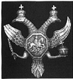
Russian Double-headed Eagle Crest used to mark Russian territorial claims in America.

In the 1780's a Russian trader, Gregory Shelikov, argued that sending annual trading expeditions to the New World across the Bering Strait was unnecessarily expensive and dangerous. The time had come, he argued, for the establishment of permanent trading posts in Alaska. The importation of a few hundred Russian settlers, Shelikov reasoned, could lead to the systematic exploitation of the sea otter habitats all along the Alaskan coast—and vast profits. As the natives might not be receptive to such a colonial intrusion, Shelikov suggested that the commercial adventure assume a military dimension as well. A Russian settlement in Alaska, atop the North Pacific, would extend Russian political and military influence as far as Spanish California, British Hawaii, and the Spanish Philippines.