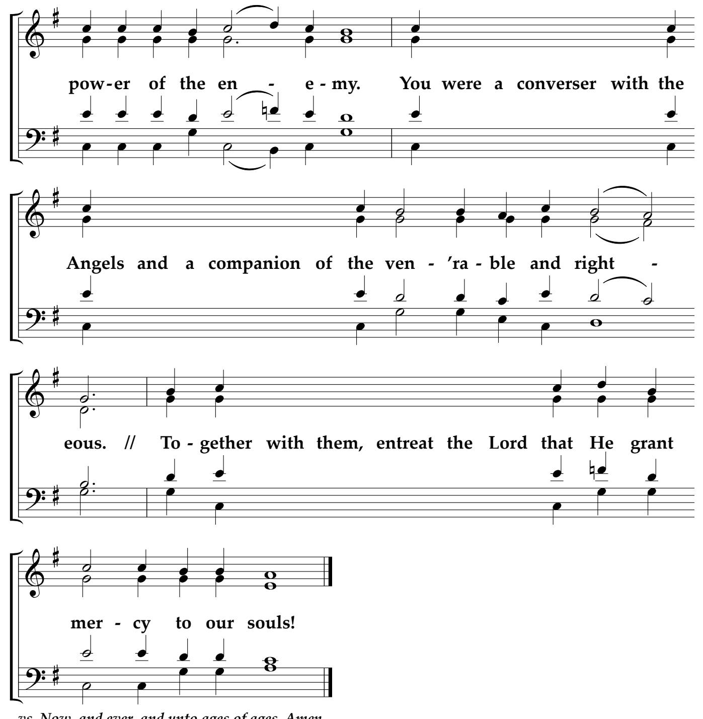
vs. Now, and ever, and unto ages of ages. Amen.