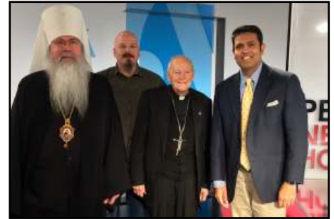
Metropolitan Tikhon with Cardinal Theodore McCarrick and PBS staff on News Hour set.