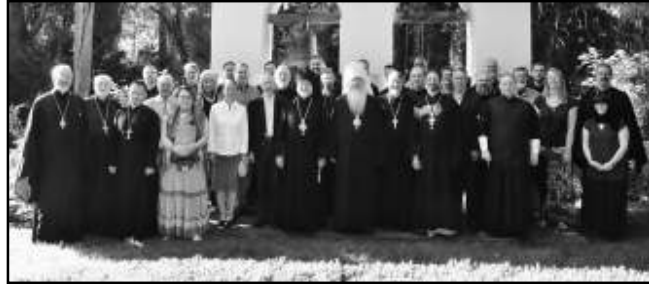
2016 Mission School faculty, participants

Twenty-six clergy and lay leaders representing every diocese completed the OCA's second annual Mission School, held at Immaculate Conception Seminary here August 22-26, 2016.