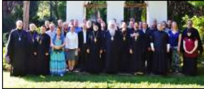
2016 Mission School faculty, participants

HUNTINGTON, NY – Twenty-six clergy and lay leaders representing every diocese completed the OCA's second annual Mission School, held at Immaculate Conception Seminary here August 22-26, 2016.