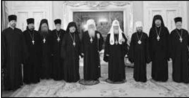
Patriarch Kirill receives Metropolitan Tikhon, OCA delegation, as his residence.

SYOSSET, NY – At the invitation of His Holiness, Patriarch Kirill of Moscow, His Beatitude, Metropolitan Tikhon and a delegation from the Orthodox Church in America joined the Primates and representatives of the Local Orthodox Churches at services and related festivities marking His